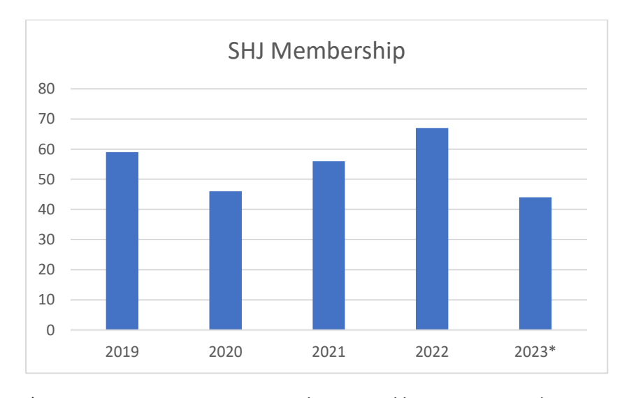
*2023 – NB in 2022, 12 new members joined between Apr and Sep

Membership peaked at 67 this year which we believe is the highest level ever (we have records up to 2012 and from 2019 on). There were quite a few non-renewers from 2022-2023 which means we are currently sitting at 44 members in 2023, but, based on last year, we would expect this to increase by 10-15 over the year as happened in 2022.